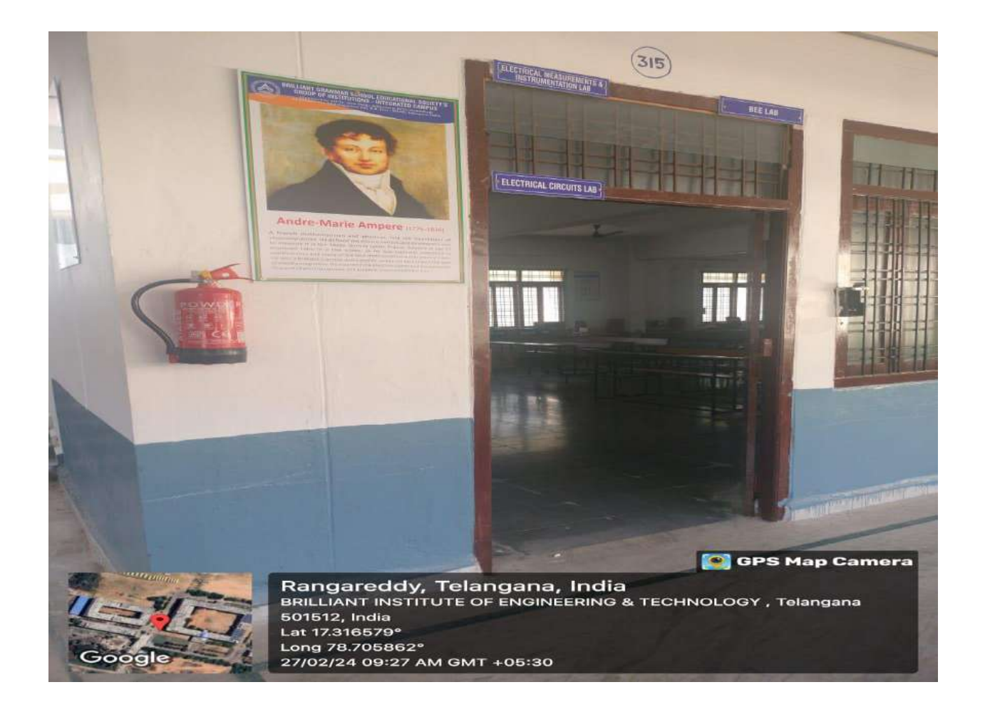
PRINCIPAL PRINCIPAL BRILLIANT INSTITUTE OF ENGINEERING AND TECHNOLOGY VIII & Mdi: Abdullepur, S.R. Dist-501 505,