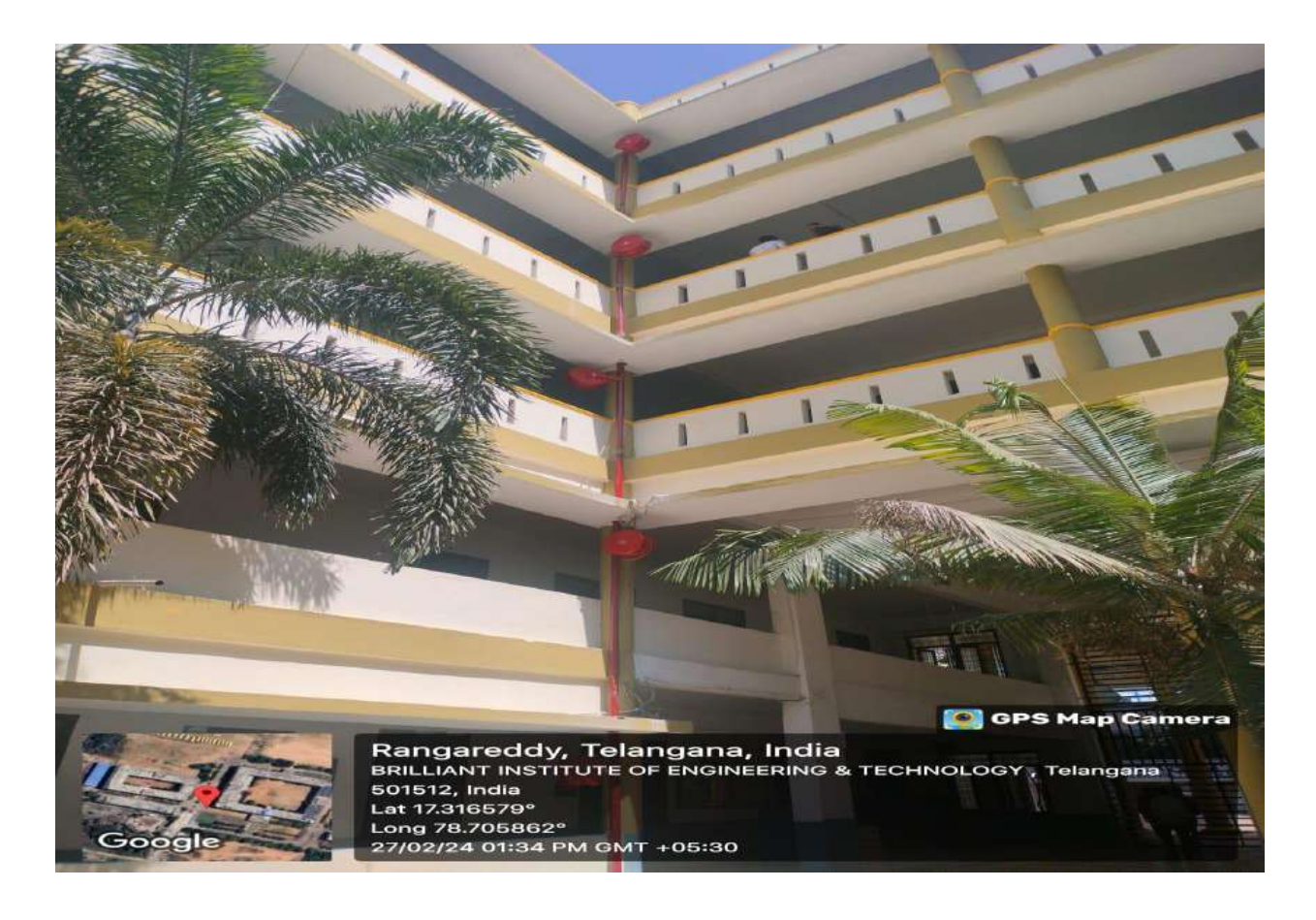
PRINCIPAL PRINCIPAL BRILLIANT INSTITUTE OF ENGINEERING AND TECHNOLOGY VIII & Mdi: Abdullepur, S.R. Dist-301 505,