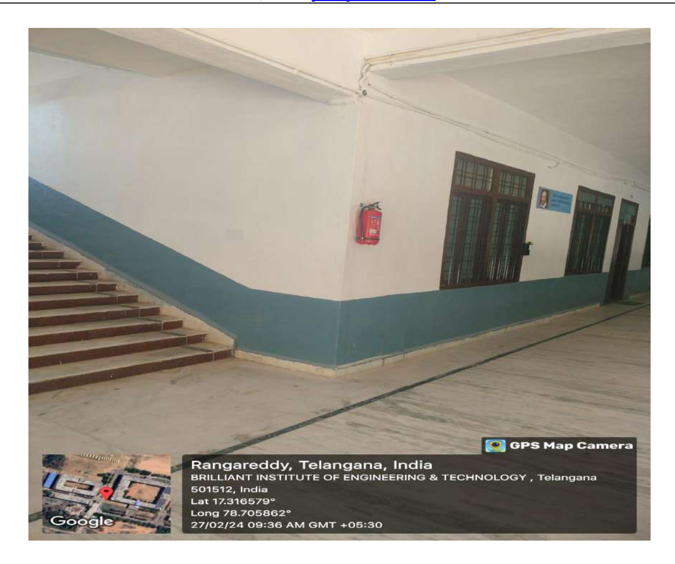
BRILLIANT INSTITUTE OF ENGINEERING AND TECHNOLOGY VIII & Midl: Abduttepur, S.R. Dist-501 505,